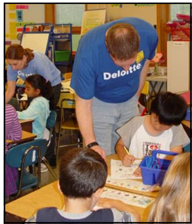
Deloitte volunteers assist children with a lesson plan.

The Deloitte employees spent the morning at the chapter learning about the program and worked in groups to develop their own lesson plans. These water safety lesson plans were then presented to nearly 500 schoolchildren in individual classrooms at the Maurice Hawk Elementary School in Princeton Junction. The lessons promoted healthy water recreation for the summer season.