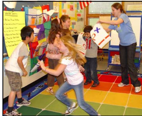
Maurice Hawk students participating in educational relay race.