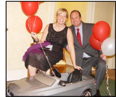
Silent Auction Winners

Sponsors included Rhodia, Black Rock, Johnson & Johnson, Miele, Volvo Cars of North America, Long Motor Company, Bloomberg, PNC Bank and URS Washington Division. Local businesses such as Flemington BMW, Flemington Furs, Hamilton Jewelers, Jet Airways, and The Leela Kempinski Mumbai provided items to be sold in the silent auction.