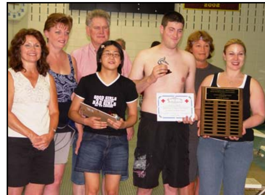
...and awards were presented.